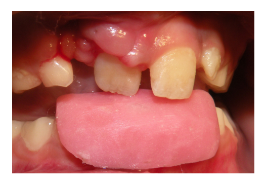
[Table/Fig 8]: Lower anterior inclined plane for correction of cross bite after establishment of healing

A review of the cases which were reported from 1969 to 1990 showed a predilection of non-syndrome multiple supernumerary teeth in the mandible. [3] The association with cleft lip and palate results from the fragmentation of the dental lamina during cleft formation [4] and are the second most common anomalies which are found at the cleft area. [5] The numerical anomalies, either anodontia or supernumerary teeth, are seven times more frequent in patients with orofacial cleft. [6] The congenital absence of teeth frequently involves the absence of the maxillary lateral incisor which is adjacent to the cleft area. [7,8]. Hence, this case reports the rare finding of both the congenital absence of teeth and the presence of supernumerary teeth.