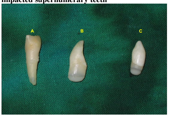
[Table/Fig 7]: (A) Extracted right upper primary central incisor, (B & C) surgically extracted supernumerary teeth

[Table/Fig 6]: Surgical extraction of the impacted supernumerary teeth