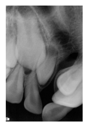
[Table/Fig 4]: Intraoral radiograph revealing the more definite position of the supernumerary teeth

Extraction of the retained primary dentition and the surgical removal of the supernumerary teeth were carried out [Table/Fig 5], [Table/Fig 6], [Table/Fig 7]. Once the healing was established, the patient was advised a lower anterior inclined plane [Figure. 8].