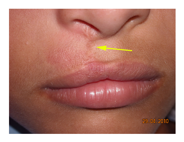
[Table/Fig 1]: Extra oral view showing evidence of scar as a result of cleft correction in the upper lip towards the right side of the patient

Intra oral examination revealed a cross bite of the right maxillary central incisor and the missing lateral, with a retained right maxillary primary central incisor in the region [Table/Fig 2].