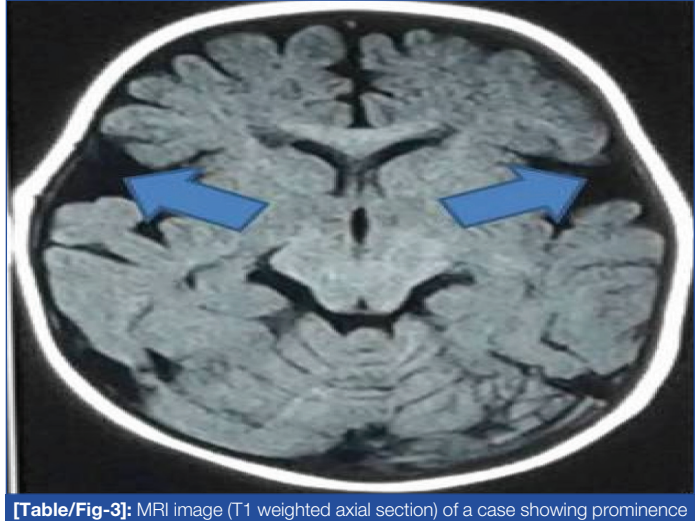
[ Table/Fig-3 ]: MRI image (T1 weighted axial section) of a case showing prominence of fronto-temporal atrophy with bilateral open sylvian fissures (Giving characteristic Bat wing appearance).

Demographic characteristics, clinical features, neuroimaging and metabolic data were tabulated in [Table/Fig-2]. Median age for onset of symptoms was seven months (IQR: 6.5-8). Most common clinical, neuroimaging and metabolic features were: History of Consanguinity (9/13), seizures (9/13), dystonia (8/13), global developmental delay (predominantly motor and speech) (13/13) frontotemporal atrophy (8/11), glutaric aciduria (13/13) (Normal range: 0-31.2 mmol/mol of creatnine). Frequency of other features were macrocephaly (2/13), elevated ammonia (0/13), elevated lactate (4/11), elevated glutarylcarnitine on TMS (7/12) (Normal Range: 0.00- 0.56 µmol/L). Characteristic neuroimaging finding of fronto-temporal atrophy and