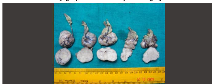
[Table/Fig 1]: Gross picture of excised tumour nodule

Grossly, the tumour was composed of nodules of varying sizes which were 1.5 to 3.5 cm diameter. No part of the intestine was attached to the resected nodules. The cut surface of these nodules was firm and fleshy grey-red in colour [Table/Fig 1].