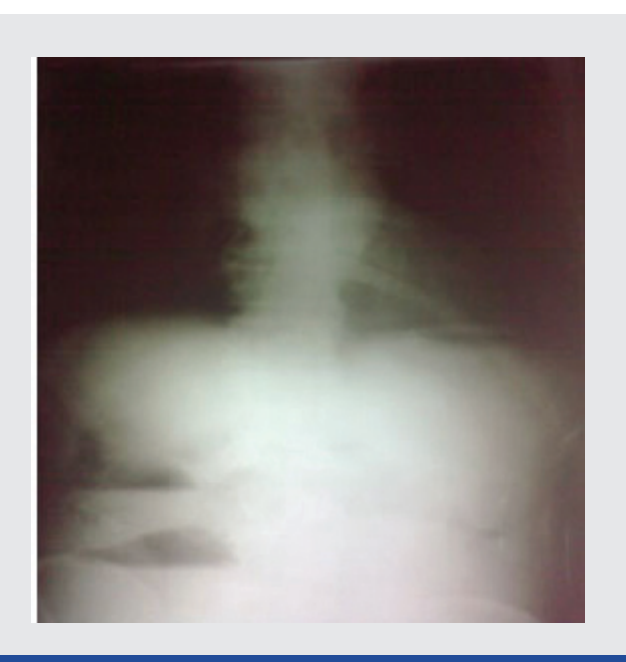
[Table/Fig-1]: X-ray erect abdomen shows multiple air fluid level

The current hypothesis focuses on the abnormalities in the smooth muscles or the myenteric plexus [1]. A careful microscopic examination will reveal three types of abnormalities [6].