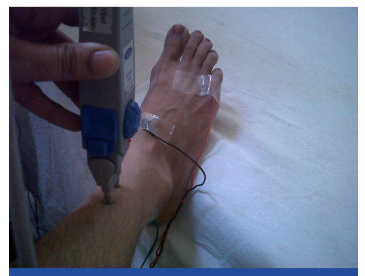
[Table/Fig-2a]: Electrode placement for motor peroneal nerve study