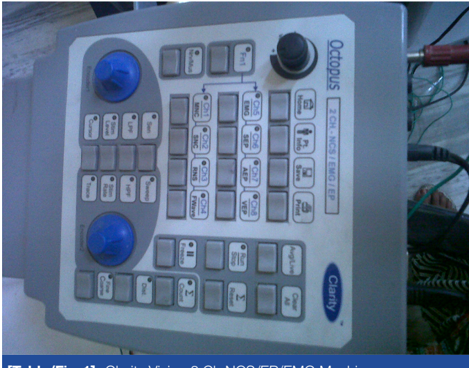
[Table/Fig-1]: Clarity Vision 2 Ch NCS/EP/EMG Machine