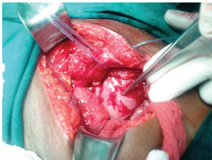
[Table/Fig-2]: Umbilical sinus tract travelling down into pelvis attached to ovarian mass