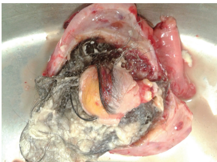
[Table/Fig-4]: Cut section of ovarian mass containing hair, cheesy material, cartilage and fat

germ lines, essentially recapitulating any tissue of the body. Examples include hair, teeth, fat, skin, muscle, and endocrine tissue. Mature cystic teratomas account for 10-20% of all ovarian neoplasms. They are bilateral in 8-14% of cases [1]. Cystic teratoma affects women during reproductive years. Most are asymptomatic to start with, later on an enlarging mass produces vague abdominal lump, pain or abnormal uterine bleeding. Pain is usually dull aching, moderate to severe in intensity and remains constant. Torsion and hemorrhage present as acute abdomen and confer surgical emergency. Other