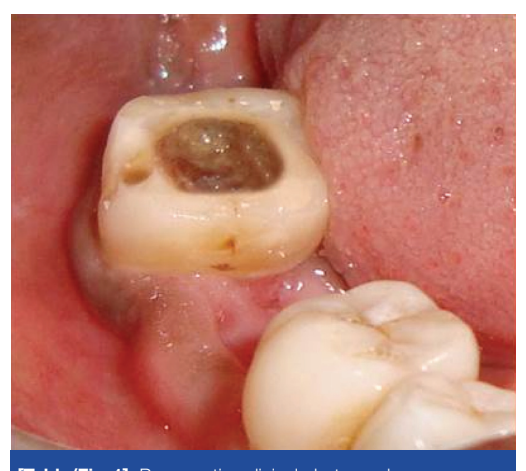
[Table/Fig-1]: Preoperative clinical photograph