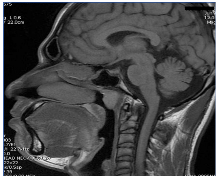
Table/Fig-1: Endoscopic view of the cystic lesion in the nasopharynx. [Table/Fig-2]: T1 weighted MRI image showing hyperintense signal