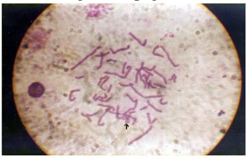
(Table/Fig 3) Photograph showing ring chromosome

2) 46, XYr (X):- Out of 84 cases studied, two cases were showing ring chromosome. Chromosome 'X' was found to be ring chromosome [Table/Fig 3].