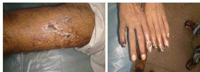
[Table/Fig-4]: Showing healing of skin lesions on lower limbs after 2 months of treatment. [Table/Fig-5]: Showing healing of vasculitic lesions of digits after 2 months of treatment.