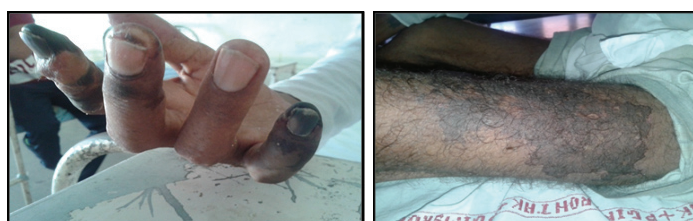
[Table/Fig-1]: Showing blackish discoloration of digits. [Table/Fig-2]: Showing cutaneous necrotizing lesions involving both lower limbs.

Clinical manifestation of hepatitis B virus infection depends on patient's age, immune status at the time of infection and the stage at which disease is recognised. The most common persistent viral infection in human is the chronic HBV infection. Almost 360 million people in the world today are estimated to be persistently infected with HBV and 600,000 die each year from HBV-related liver disease or hepatocellular carcinoma [1]. Acute or chronic HBV infection are known to cause various extrahepatic manifestations which are thought to be immune complex mediated, which in turn lead to aggregation of platelets and activation of Hageman factor, thus initiating inflammatory reactions and microthrombi formation [2]. These complexes are deposited mainly in small arteries, renal glomeruli and the synovial of joints and clinically manifest as vasculitis, nephritis and arthritis [3]. Vasculitis is perhaps the most serious but uncommon extrahepatic manifestation of HBV infection