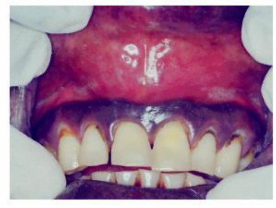
(Table/Fig 9) Clinical picture of midline swelling in maxillary arch in (case 3)

37 and 28 were severely decayed. Generalized moderate to severe calculus and stains were noticed. The maxillary left central and lateral incisors were not carious and did not respond to vitality tests. A provisional diagnosis of a radicular cyst in relation to the maxillary left central incisor was made. On further investigation, the radiographs revealed a large radiolucent area in the anterior maxilla, involving one of the two impacted supernumerary teeth (mesiodens) with short roots and were suggestive of a dentigerous cyst. Further, root resorption of 21 and 22 was evident ( Figures 10-11 ) [Table/Fig 6] .Routine haematological and biochemical tests were normal. Maxillary left incisors [21],[22] were endodontically treated and were obturated with gutta-percha. Then, under general anaesthesia, surgical extraction of the impacted supernumerary teeth and enucleation of the cyst was done, followed by retrograde filling of 21 and 22 with mineral trioxide aggregate. The post operative course was uneventful. The histological examination of the specimen was suggestive of a dentigerous cyst.