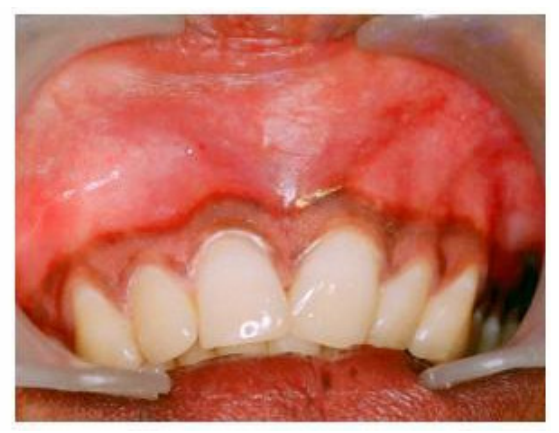
(Table/Fig 5) Clinical picture with swelling in the mucobuccal fold between the maxillary central incisors (case 2)

positioned mesiodens between the maxillary central incisors. Displacement of the roots of the maxillary left incisors and the canine was clearly evident, resulting in a change in their axial inclination. No evidence of the resorption of the roots was seen (Figures 6-8) [Table/Fig 4]. Clinical and radiographical findings were suggestive of dentigerous cyst. Routine haematological investigations were normal. The mesiodens was surgically extracted and the cystic lining was enucleated under local anaesthesia. The post operative healing was uneventful. The patient was under follow-up six months and presented complications. Histopathological examination of the specimen confirmed the diagnosis of a dentigerous cyst.