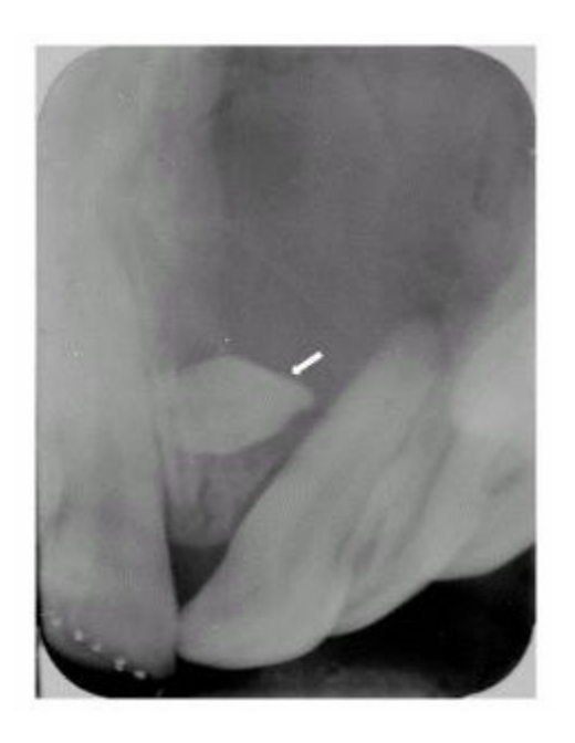
(Table/Fig 8) Periapical radiograph (case 2)