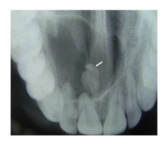
(Table/Fig 2) Occlusal radiograph showing a unilocular radiolucent lesion (case 1)