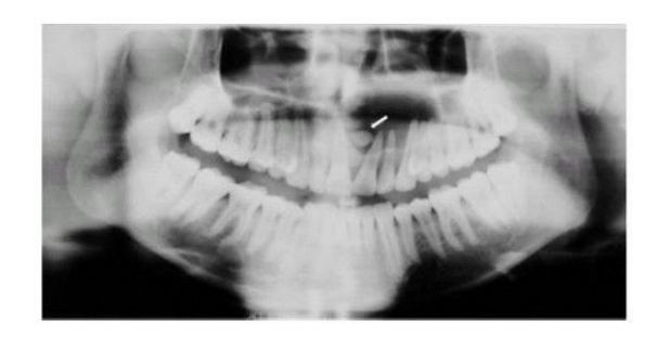
(Table/Fig 6) Panoramic radiograph (case 2)