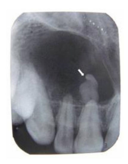
(Table/Fig 3) Periapical radiograph (case 1)