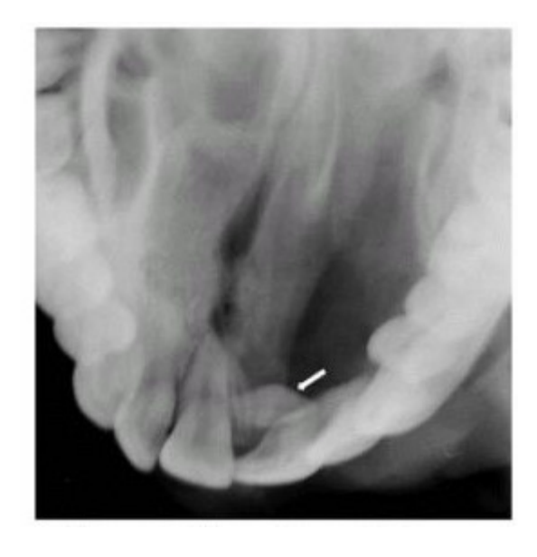
(Table/Fig 7) Occlusal radiograph (case 2)