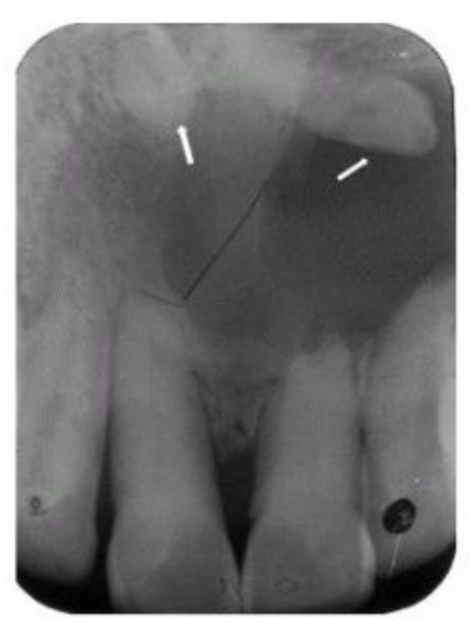
(Table/Fig 11) Periapical radiograph (case 3)