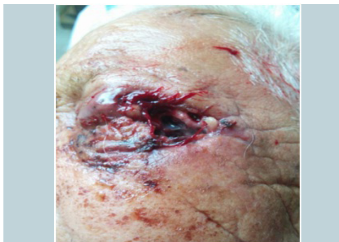
[Table/Fig-1]: Left lateral canthus orbital myiasis.