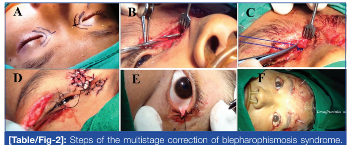
a) Skin marking of Double Z-Plasty in epicanthal area; b) Manual 3.5 gauze orthopaedic drill is used to made hole in a frontal process of the maxilla at the anterior lacrimal crest; c) 1-0 Prolene suture used for intranasal fixation; d) Double Z-Plasty and flap transfer from upper to lower lid lateral ectropion correction; e) Lateral canthoplasty; f) Bilateral tarsofrontalis sling.

This corrects the deeper component of telecanthus. Two rectangular flaps created at the skin surface are transposed and repaired in a triangular fashion, which was the principal of the double Z-plasty. A 5-0 silk suture was placed to reapproximate the skin edges [Table/Fig-2d]. In this procedure, there was advancement of the medial canthus and simultaneous vertical stretching of skin at canthal region. Thus, telecanthus and epicanthus were corrected. A pressure patch was applied. After three months, a 2<sup>nd</sup> stage procedure was undertaken. In this stage, a lateral canthoplasty was performed for horizontal lid fissure widening in the usual oculoplastic fashion [Table/Fig-2e]. Further, a tarsofrontalis sling ptosis repair utilizing a silicone rod in the typical fox pentagon formation was performed to correct the moderate to severe ptosis [Table/Fig-2f]. Postoperatively, all patients were continued on a silicone gel to the surgical wounds for six months.