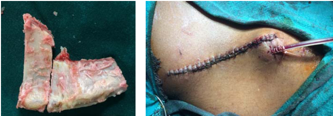
[Table/Fig-3]: Harvested iliac strut.