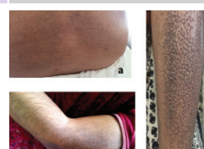
[Table/Fig-1]: Clinical presentation of cutaneous amyloidosis: a) Macular amyloidosis showing rippled pigmentation on lower back; b) Lichen amyloidosis showed lichenified papules and nodules with pigmentation on lower limbs; and c) Biphasic amyloidosis showed rippled pigmentation with papules on extensor aspect of arm.

Two punch biopsy skin tissues were taken using disposable punches measuring between 3 mm to 4 mm from 50 selected patients. One set of specimen was fixed in 10% formalin and stained with H&E and CR stain which were examined under light microscopy. Other set of specimen was fixed in Michels stain and was sent for DIF.