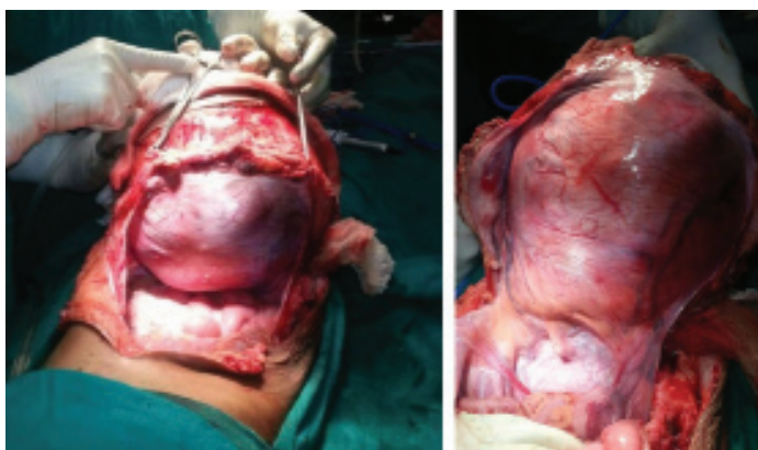
[Table/Fig-2]: Surgical dissection of mass. [Table/Fig-3]: Complete surgical excision.