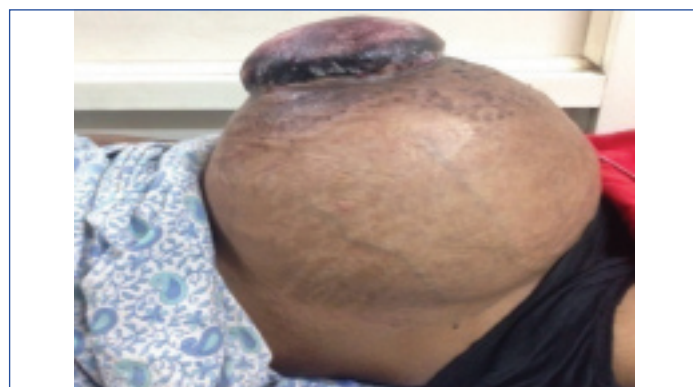
[Table/Fig-1]: Large abdominal mass (Post natal day 15).

Ultrasound was done which revealed large abdomino pelvic mass with heterogeneous texture but organ of origin could not be commented upon. Consequently, MRI abdomen was done which revealed a round well defined 40 x 20 x 20 cm mass arising from muscle of anterior abdominal wall with areas of superficial ulceration. Posteriorly the mass was displacing the peritoneum and its contents; however plane between the mass and peritoneum was maintained. Findings were suggestive of soft tissue tumour of anterior abdominal wall, and provisional diagnosis of desmoid tumour was made. Uterus and adnexa were normal in morphology.