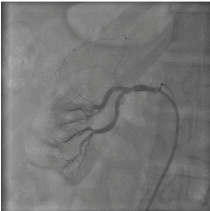
[Table/Fig-2]: Post-procedural renal angiogram after percutaneous transluminal angioplasty with drug-eluting stent.