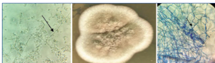
[Table/Fig-3]: A 20% KOH showing growth of filamentous fungal element (40X). [Table/Fig-4]: Phaeoid fungus after eight days of incubation on SDA media. [Table/Fig-5]: Showing tortuous fungal hyphae under LPCB stain (40X).