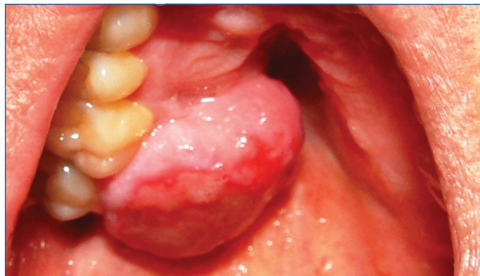
[Table/Fig-1]: A large ulcerated submucosal mass originated from palatal gingiva of teeth 17 and 16 and extended towards the palate.