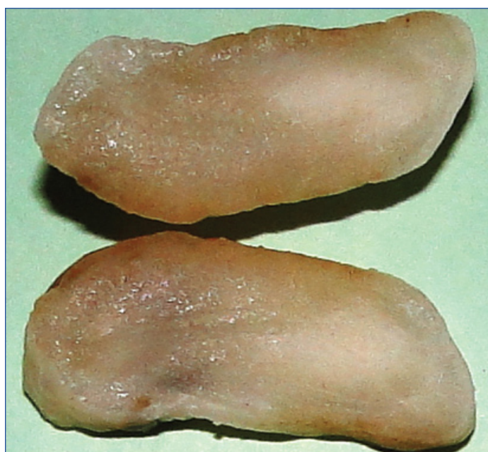
[Table/Fig-2]: The gross specimen showing a circumscribed mass with solid, creamy-white and glisten cut surface.

circumscribed zone of myxomatous stroma surrounded by denser collagenous connective tissue. The cells in myxomatous area were ovoid, fusiform, or stellate without atypia [Table/Fig-3,4]. These microscopic features were consistent with the diagnosis of oral focal mucinosi s (OFM). On follow up, the patient was disease free for 3 years.