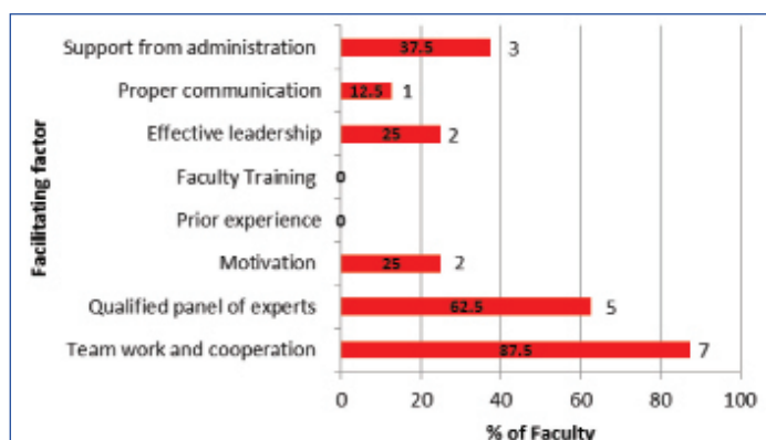
[Table/Fig-2]: Faculty (n=8) viewpoint on facilitating factors that contributed towards curriculum development. Notes: Number next to bar indicate the number of faculty for each response.