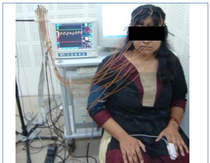
[Table/Fig-3]: Experimental setup of data acquisition system for recording electroencephalogram (EEG) signals.

The induced emotion can also be determined by evaluating the ANS activity as these changes will stimulate the periphery organs and can be evaluated by measuring Heart Rate (HR), Blood Pressure (BP), Cardiac Output (CO), Total Peripheral Resistance (TPR), Stroke