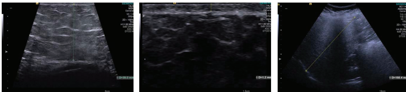
[Table/Fig-1]: Greyscale USG image with linear transducer showing the method of measurement of subcutaneous abdominal fat thickness. [Table/Fig-2]: Greyscale USG image with linear transducer showing the method of measurement of skin thickness. [Table/Fig-3]: Greyscale USG image with convex transducer showing the method of measurement of liver span.

using standard BMI criteria [7], Underweight (BMI<18.5 kg/m 2 ), Normal (BMI ≥18.5 and <25 kg/m 2 ), Overweight (BMI≥25 and <30 kg/m 2 ) and Obese (BMI≥30 kg/m 2 ). This was done to highlight the distribution of the data under study.