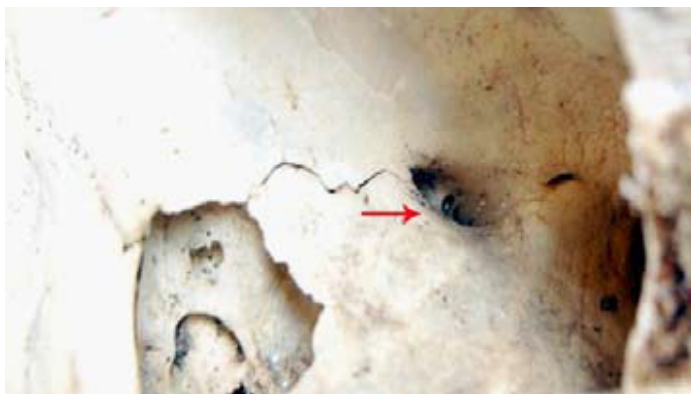
[Table/Fig-3]: MEF divided in to two parts.