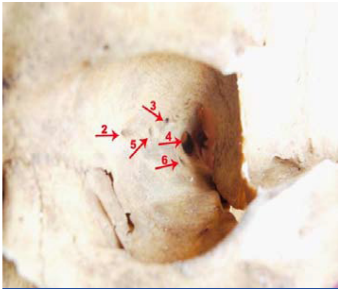
[Table/Fig-2]: Middle ethmoidal foramen and extra foramen.

middle ethmoidal foramen and the posterior ethmoidal foramen were absent, we measured the distance between the anterior ethmoidal foramen to the optic canal by subtracting the distance between the frontomaxillary sutures to the anterior ethmoidal foramen from the frontomaxillary suture to the optic canal [Table/Fig 2].