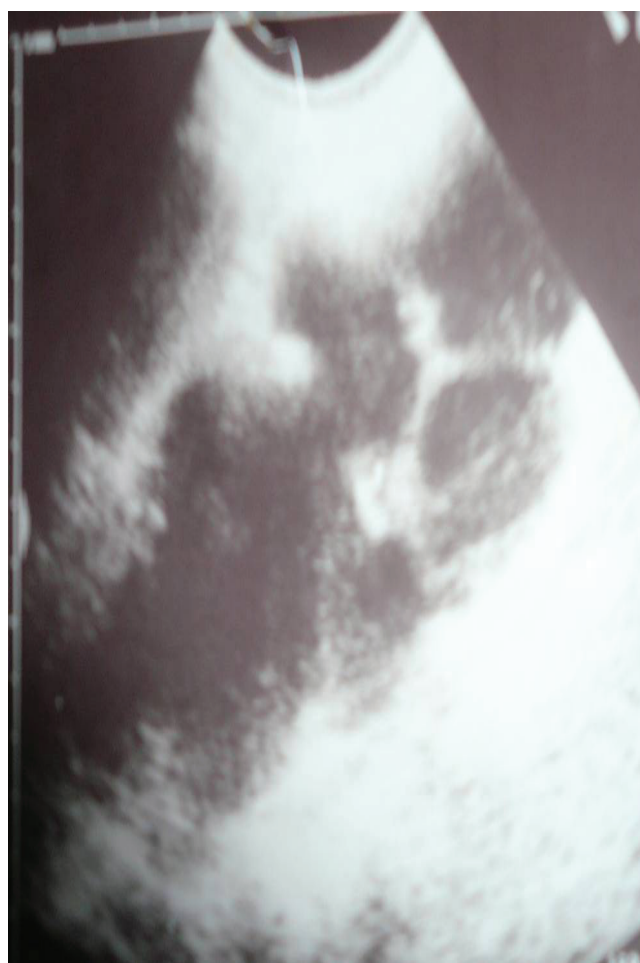
[Table/Fig 3]: Abdominal ultrasound

Abdominal ultrasound [Table/Fig 3] revealed an enlarged, non calcified, left kidney measuring 16cm x 7cm in its bipolar and antero-posterior diameters, with multiple communicating cysts of varying sizes. No normal renal parenchyma tissue was seen. The renal pelvis and the ureter were not visualized. In addition, the numerous cysts contained fine internal echoes. The liver, gallbladder, pancreas, spleen and the right kidney were normal. There was no ascites. A diagnosis of cystic renal mass with infection or bleeding into the cyst was made. [Table/Fig 3]