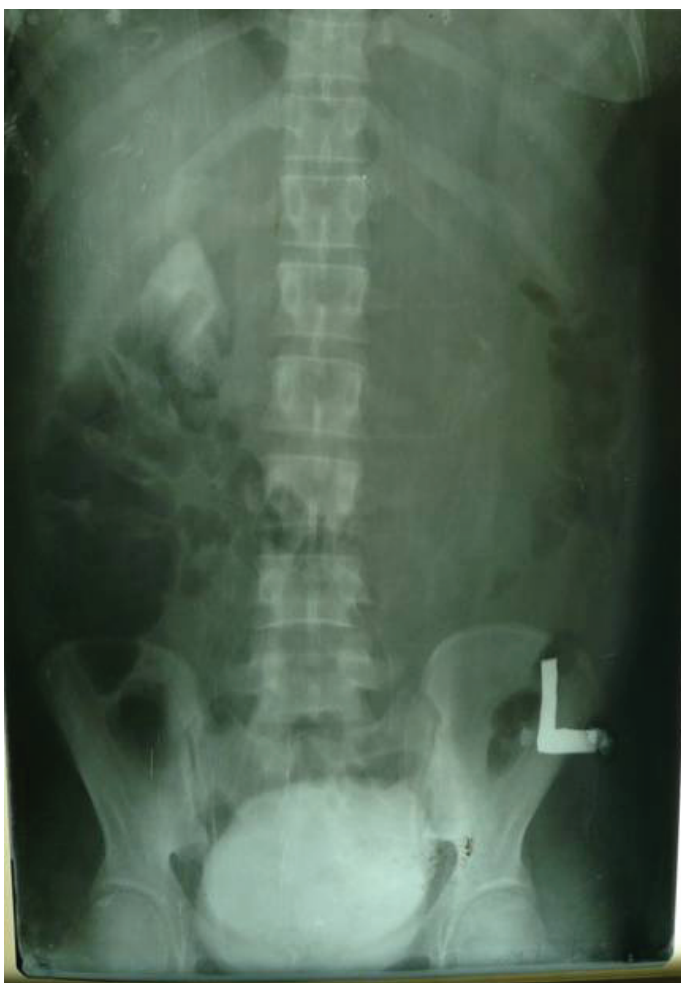
[Table/Fig 4]: Intravenous urography

showed no excretion from the left kidney after 48 hours, while the right renal outline was faintly demonstrated because of poor bowel preparation. The right renal pelvis was baggy and extrarenal. [Table/Fig 4].