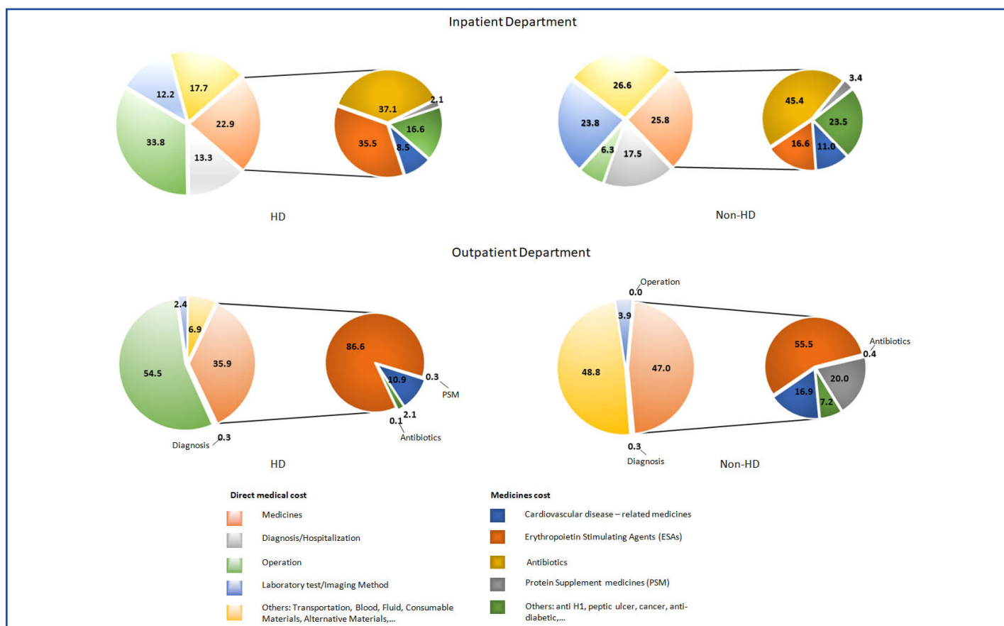
[Table/Fig-5]: The proportion of direct medical costs by cost component and by cost of medicines (%). Abbreviation: IPD: Inpatient Department; OPD: Outpatient Department; HD: Haemodialysis; Non-HD: Non-Haemodialysis

$272 estimate reported in another Indian study [29]. In the present study, CKD patients without HD in the ≤ 49-year-old age group had the highest direct medical cost of US $1,838; the lowest cost belonged to the ≥ 70-year-old age group. The research of Wyld M et al., carried out in Australia indicated the opposite result; the highest direct medical cost of treating CKD without HD was in the older group, whilst the youngest group had the lowest CKD treatment cost [30]. The cost of treating CKD without dialysis is twofold higher for rural residents compared to urban dwellers (US $1,176.5 and US $544.4, respectively). Ozieh MN et al., depicted a different result, in that city dwellers had a significantly higher direct medical expenditure [28]. The cost of treatment was also found to be higher in patients receiving reimbursement from insurance, which is consistent with research at a tertiary hospital in India [19]. The reason that higher costs are associated with insurance could be due to insured patients demanding the best possible treatment. For CKD stages 2 to 4, hospitalisation costs accounted for 47% and