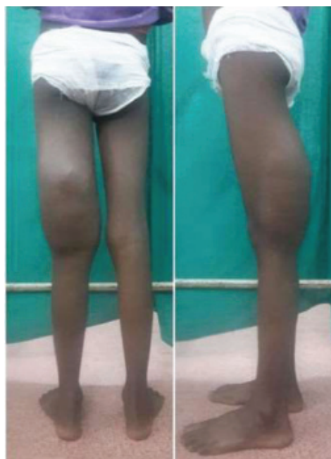
[Table/Fig-1]: Posterior and lateral view respectively showing the extension of swelling.

the diagnosis of chronic haematoma. Postoperative period was uneventful and sutures were removed at 10 th postoperative day. At the end of about one year of follow-up, patient was symptom free and had the normal looking limb.