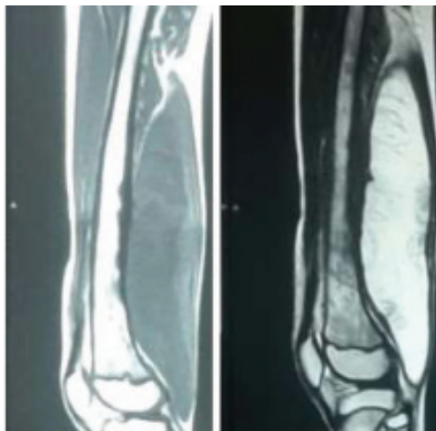
[Table/Fig-3]: T1 and T2 weighted MRI respectively showing the well defined cystic lesion with fluid intensity in deep posterior muscles of thigh.