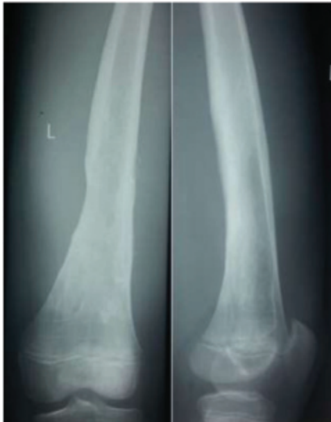
[Table/Fig-2]: Scalloping effect of mass over postero-lateral part of distal femur.