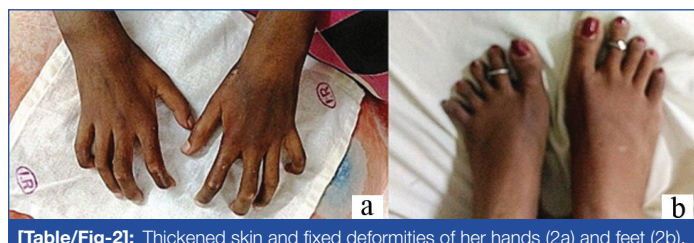
[Table/Fig-2]: Thickened skin and fixed deformities of her hands (2a) and feet (2b).

She was initially managed by temporary pacing followed by single chamber permanent pacemaker implantation. Her 2-D Echocardiography revealed global Left Ventricular (LV) dysfunction with LV Ejection Fraction (LVEF) of 42% [Video-1].