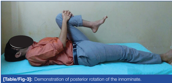
[Table/Fig-3]: Demonstration of posterior rotation of the innominate.

Repeated posterior rotation of innominate: in supine position repeated posterior rotation of the innominate was encouraged by getting the hip and knee into flexion towards the chest [Table/Fig-3].