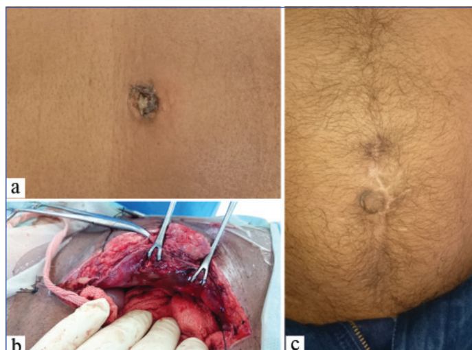
[Table/Fig-1]: a) Preoperative presentation of a discharging umbilicus is seen; b) On peroperative was found to have oedematous and inflamed rectus muscle and abdominal wall; c) Postoperative image of a healthy umbilicus with healed laparotomy wound.

A 26-year-old man came with a three day history of painful umbilicus with discharge. He had no fever or any other systemic features. Clinically, there was a seropurulent discharge at the umbilicus [Table/Fig-2] along with erythema and tenderness in periumbilical region. Routine laboratory investigations were within normal limits. He was taken up for an early incision and drainage with debridement of umbilicus. A similar tuft of hair in a small subcutaneous tract was discovered which was removed and excision of the tract was done. Wound healed with secondary intention and oral antibiotics for 5-7 days. One year follow-up in this case was also unremarkable and to our surprise he was also a barber by trade with similar professional practices.