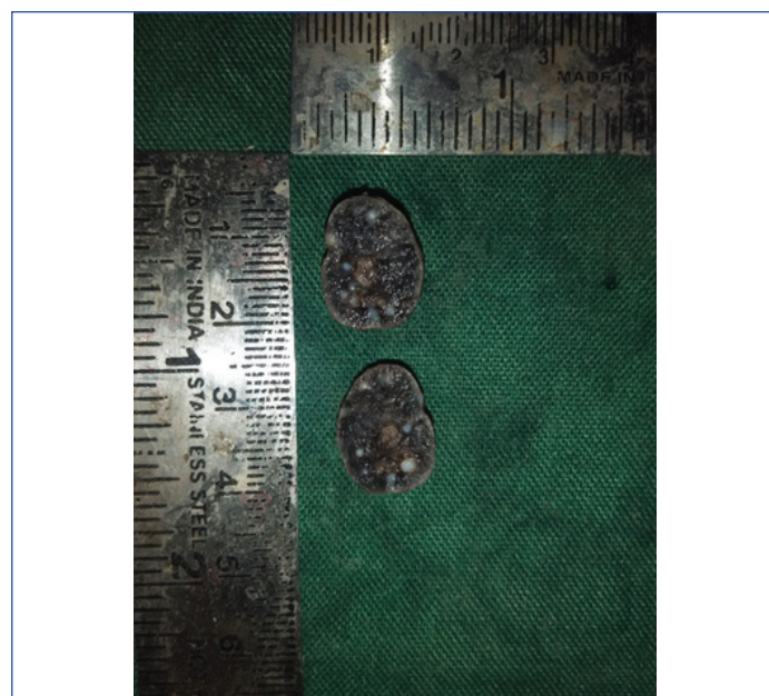
[Table/Fig-2]: Macroscopic examination of specimen received in 10% formalin.

centre was blackish with few white elevated areas and the periphery was brown in colour [Table/Fig-2].