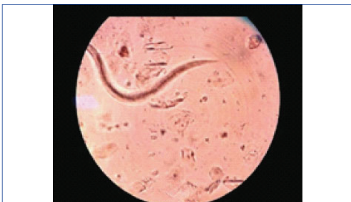
[Table/Fig-1]: Rhabditiform larvae of Strongyloides stercoralis in stool.

Stool examination showed multiple rhabditiform larvae of Strongyloides stercoralis as seen in [Table/Fig-1]. Ivermectin was initiated based on the weight of the patient (9 mg/day for 2 days). In view of suspected hyperinfection, sputum was inspected and was found to be flooded with multiple larvae of Strongyloides stercoralis as evident in [Table/Fig-2].