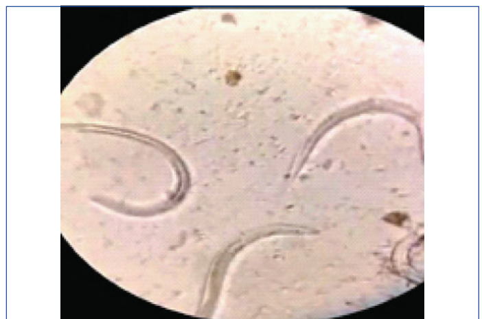
[Table/Fig-2]: Multiple larvae in sputum.

The patient deteriorated and was intubated in view of dampening sensorium. Blood culture showed growth of Salmonella typhimurium susceptible to ciprofloxacin which the patient was already on, hence continued. Despite best efforts, the patient succumbed to illness after two days of management in the intensive care.