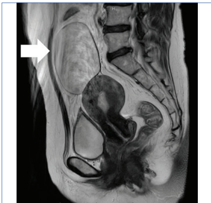
[Table/Fig-1]: T2-weighted MRI scan demonstrating cystic mass (arrow) without any solid part (Sagittal).

On examination, her vitals were stable with pulse rate of 90/min and systemic examination was within normal limits. The patient had rebound tenderness in lower abdomen. Vaginal ultrasonography confirmed the presence of a cystic mass of 87.8 mm diameter without a solid component, suggestive of an ovarian tumour. Ascites was scant, and there were no abnormal findings of the uterus and the right adnexa. MRI showed a cystic mass without any fat component [Table/Fig-1]. In the axial image, a coil-like structure was detected between the uterus and the cyst [Table/Fig-2]. Normal ipsilateral ovary could not be detected.