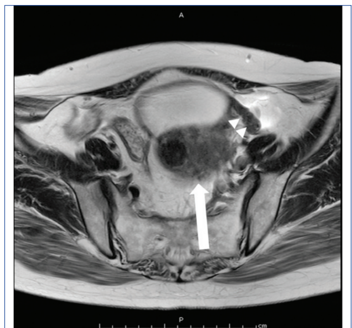
[Table/Fig-2]: T2-weighted MRI scan demonstrating a coil-like structure (arrow heads) between the uterus (arrow) and the cyst (Axial).

All biochemical and haematological parameters were within normal limits except the WBC count, which was 13870/ \mu L (normal 3300-8600/ \mu L). The serum tumour marker levels were within the normal range: CA125, 14.3 U/mL (normal <35.0 U/mL); CA19-9, 17.6 U/mL (normal <37.0 U/mL); and Carcinoembryonic Antigen (CEA), 2.0 ng/mL (normal <5.0 ng/mL).