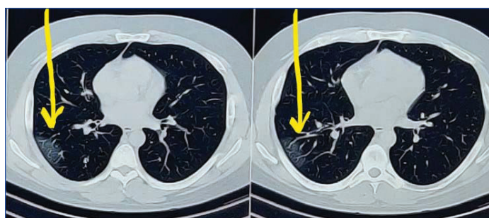
[Table/Fig-1]: Computed tomography axial view of chest.

creatinine 1.86 mg/dL [Table/Fig-3]. Electrocardiogram showed sinus tachycardia, arterial blood gas analysis on room air revealed mild hypoxemia. Patient was treated with supplemental oxygen via nasal prongs at four liters per minute, intravenous (IV) ceftriaxone, dexamethasone, remdesivir, subcutaneous low molecular weight heparin, while his immunosuppressive medication tacrolimus was continued and mycophenolate mofetil was kept on hold. Bed-side ultrasonography of abdomen revealed no abnormalities. However, the patient continued to have high grade fever with chills and rigors with increasing oxygen requirement. Serial haemogram revealed