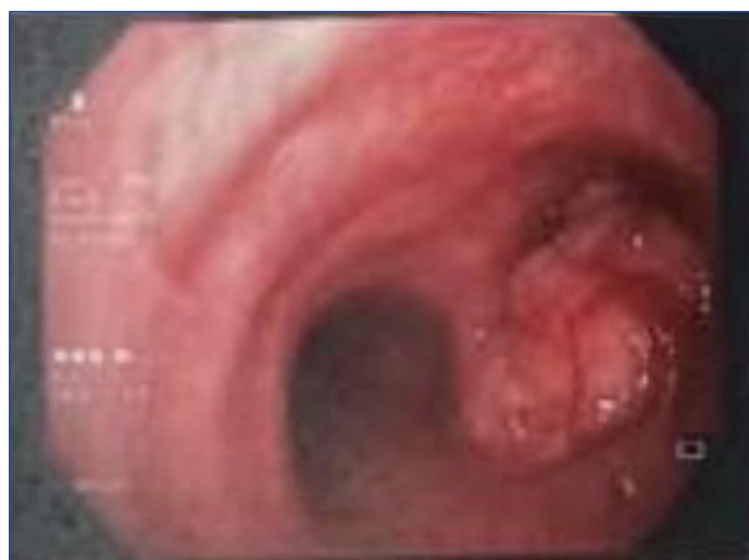
[Table/Fig-2]: Bronchoscopy depicted an approximately 1 cm exophytic, well circumscribed lesion in the right main bronchus.

Since surgery was not acceptable to patient, he opted for endobronchial interventional modalities after proper counselling and consent. Rigid bronchoscopy was performed under general anaesthesia using 11 sized tracheobronchoscope (Olympus BF TQ 170). The tumour was mechanically debulked and snared when the base of the lesion could be visualised. The debulked pieces were cleared using 2.4 mm cryoprobe (ERBECRYO 2). Total restoration of luminal patency was achieved. Post procedure small mucosal dehiscence was noted along the posterior wall of right