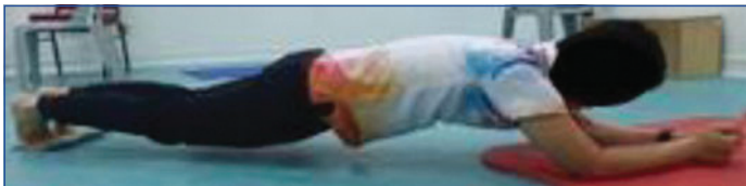
[Table/Fig-2]: Ending position: Body Saw Plank.

2. Left-sided planking: The subjects must maintain neutral spine position with pelvic in neutral and knee extended position. The subject must hold in that position for a total of 10 seconds and five second rest for two repetition and total of three sets of exercise. [Table/Fig-3] shows the position of left-sided planking.