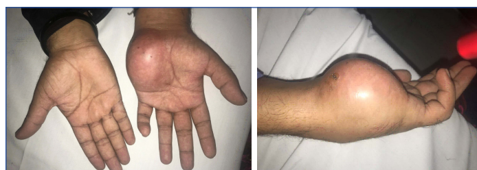
[Table/Fig-1]: Clinical view of swelling in left hypothenar area.

A 30-year-old male reported, with the chief complaint of painless swelling over the left palm and inability to extend the ring and little finger following a minor blunt trauma to the hand eight months back. The swelling gradually increased to its present size. There was no history of ulceration, discharge or redness over the swelling. On examination, a single firm non tender swelling of approximately 9x6 cm was present in hypothenar area of left hand starting proximally from the wrist crease and extending distally till distal palmar crease and from the ulnar border of the palm till the mid palmar area. The overlying skin was tense and warm to touch, but the surrounding skin was normal [Table/Fig-1,2]. On his previous outpatient consultation from another hospital, Magnetic Resonance Imaging and Fine Needle Aspiration Cytology (FNAC) were done, which were suggestive of Haemangioma.