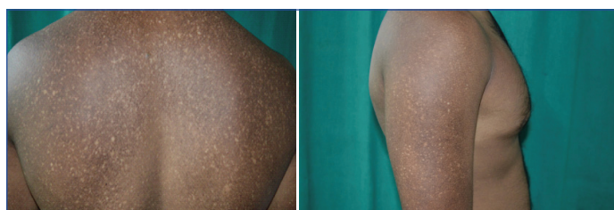
[Table/Fig-2]: Multiple hyperpigmented and hypopigmented macules all over the back; [Table/Fig-3]: Multiple hyperpigmented and hypopigmented macules over arm. (Images from left to right)

On cutaneous examination, multiple hypopigmented and hyperpigmented macules of size ranging from 0.5 - 1 cm involving back [Table/Fig-2], chest, bilateral arms and forearms [Table/Fig-3], and lower limb with sparing of palms, soles and face were seen. On further examination, the patient did not show the presence of palmar pits and breaks in dermatoglyphics. There was no mucosal involvement and the systemic examination of the patient was normal with no associated co-morbidities.