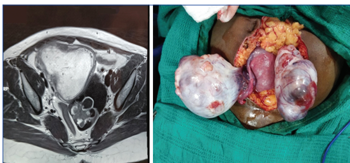
[Table/Fig-6]: Preoperative imaging and intraoperative picture of clear cell carcinoma in pregnancy.

Surgical management of an adnexal mass in pregnancy creates a dilemma to gynaecologists. Sometimes, it is difficult to discriminate ovarian malignancies from functional cysts or benign ovarian tumours. If an adnexal mass, larger than 10 cm or has complex features on imaging, or ascites or shows significant increase in size, surgical management is critical for obtaining a final histological diagnosis and ruling out malignancy. Elective surgery for suspicious ovarian masses should be delayed until the second trimester (16-18 weeks of gestation), as the risk for spontaneous abortion is comparatively