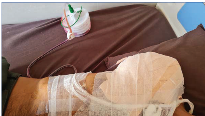
[Table/Fig-2]: Image showing right-sided upper limb amputation in the patient.