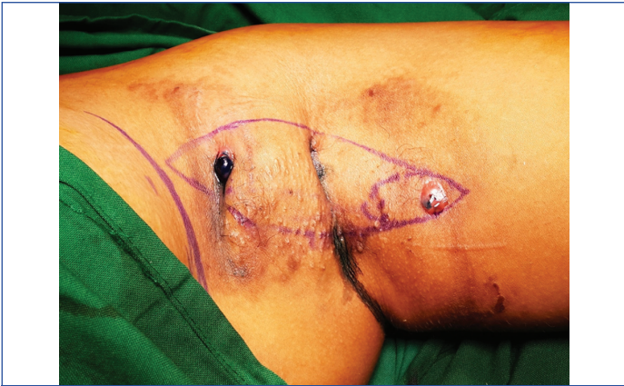
[Table/Fig-2]: Intraoperative methylene blue injection showed a sinus formation from the ulcer near the chest. Ulcer near the arm had fistulous tracts connecting it to tiny openings over mid axilla.