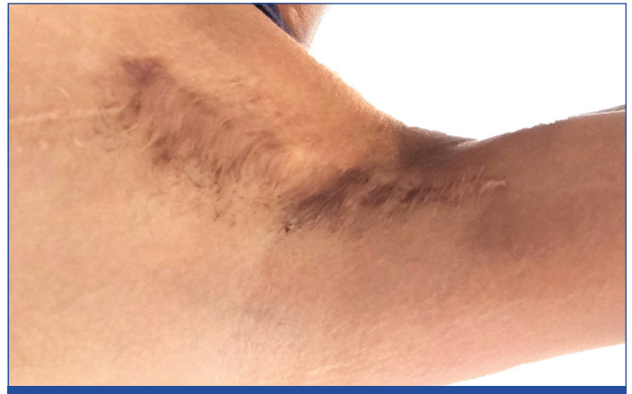
[Table/Fig-7]: A seven-year-old postoperative healing was disease-free. The wound appeared nearly normal with some areas of stretched scars.

Postoperative recovery of the patient was uneventful. Her axillary wound healed satisfactorily. The patient underwent weight loss and maintained a healthy diet and lifestyle to prevent hidradenitis afterwards and has enjoyed a seven years disease-free postoperative period to date. Aesthetic appearance of the involved axilla is satisfying, albeit with some slightly-noticeable stretching of the scars. It has not bothered the patient or prevented her from wearing sleeveless garments on social occasions [Table/Fig-7]. The patient reported excellent satisfaction with the overall treatment process.