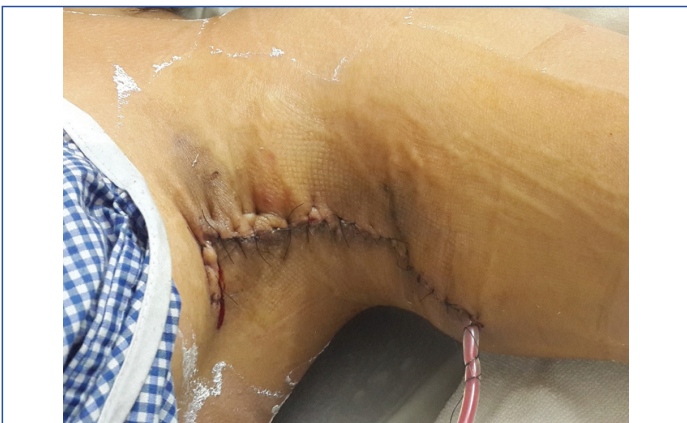
[Table/Fig-5]: Large advancement flaps extending into chest and arm, closed with progressive tension sutures, sufficiently covered the wound over a drain.