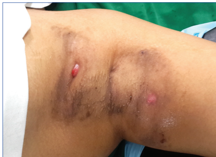
[Table/Fig-1]: Patient presented with two distinct ulcers at two opposing ends of her left axilla.

With a provisional diagnosis of recalcitrant HS, she was planned for radical surgical excision and reconstruction.