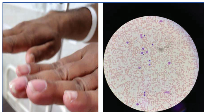
[Table/Fig-1]: Photograph showing clubbing of fingers.

reticular shadows in both lung fields predominately over mid and lower zones was observed in X-ray of the chest [Table/Fig-3]. High Resolution Computed Tomography (HRCT) of thorax revealed bilateral numerous tiny centrilobular nodules with interlobar septal thickening and traction bronchiectasis with few ground glass opacities [Table/Fig-4,5]. Restrictive pattern without reversibility was noted in pulmonary function test.