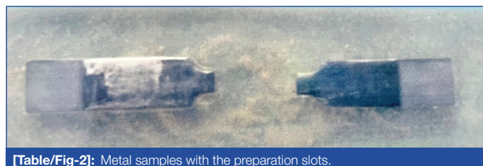
[Table/Fig-2]: Metal samples with the preparation slots.

A custom mold was fabricated with clear methyl methacrylate. It consisted of a slot of 40x10x2 mm, which would facilitate the uniformity in the porcelain buildup. The working end of the metal samples, were grounded to 1 cmx0.5 mm and made to fit into the slot. When metal specimens were placed in the slot a uniform space of 2 mm remained in the slot between the top of the mold and metal and in the test site alone the metal was 0.5 mm [Table/Fig-2]. Porcelain powders were to be mixed with the modular liquid and filled in the mold. The mold was then placed on the mechanical vibrator and the porcelain condensed. A glass slab was placed on the mold surface to make the porcelain surface smooth and of uniform thickness.