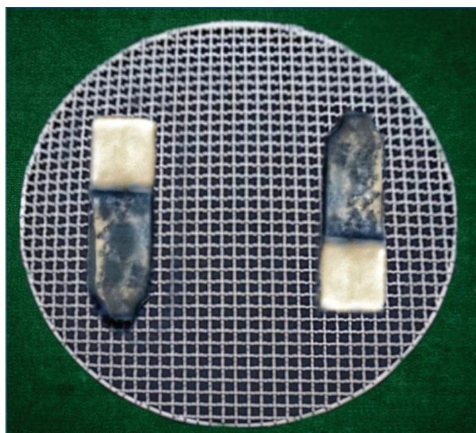
[Table/Fig-3]: Representative samples after start of ceramic work.

The porcelain bearing surface of the alloy specimen was air abraded to simulate standard laboratory procedure. Further all the samples were steam cleaned to remove any surface impurities small amount of opaque porcelain paste was mixed with the special liquid. It was applied on the metal surface with the ceramic brush. Wash opaque was painted on the metal as a thin coating; no attempt was made to completely mask the metal. After firing the wash opaque a second layer of opaque was applied to completely mask the metal. The specimen was gently vibrated to evenly spread the paste. The second firing too was done as per manufacturers instructions. The thickness of opaque layer was found to be 0.3 mm after two firings [Table/Fig-3]. The same procedure was follow for the application of opaque layer on all the 40 alloy specimens. Following this, dentin porcelain was added and all the 40 specimens and were fired according to the manufacturer's instructions. Total thickness of sample was 2.0 mm (0.5 metal+0.3 opaque+0.8 dentine+0.4 enamel) [Table/Fig-4-6].