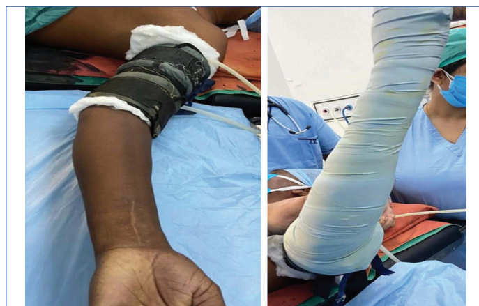
[Table/Fig-2]: Proximal and distal tourniquet.

Operating arm was exsanguinated using the Esmarch bandage and the arm was kept elevated for 2 minutes [Table/Fig-3]. Proximal tourniquet inflated to 100-150 mmHg above the patient's systolic blood pressure. Pulse oximetry was used for radial artery pulsation confirmation. A 40 mL of test solution was injected slowly over 180 sec by an anaesthesiologist who was blinded to the study drug [8]. The sensory block was assessed by pinprick every 30 sec and sensory onset was evaluated in dermatomal distribution. Motor onset was checked by asking the patient to do some voluntary movements. Sensory and motor onset was noted. Onset of sensory block was noted from administering study drug to absence of pinprick sensation in required dermatome. And onset of motor block was noted from injection of drug to absence of motor movements. After achieving sensory and motor block distal cuff was inflated and then proximal cuff was deflated.