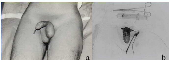
[Table/Fig-2]: Insulated plastic wire in the urethra (a) which was extracted from the urethra with the help of artery forcep (b).