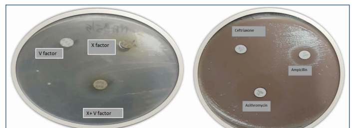
[Table/Fig-3]: Nutrient agar showed Haemophilus has only grown around the paper disc impregnated with X and V factor. [Table/Fig-4]: Antimicrobial susceptibility testing- azithromycin (15 µg), ampicillin (10 µg), ceftriaxone (30 µg). (Images from left to right)