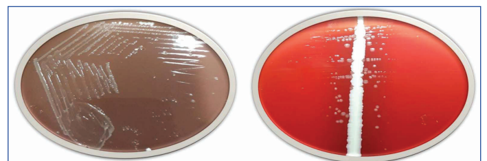
[Table/Fig-1]: Chocolate agar showing grey large, round, smooth, convex, opaque colonies. [Table/Fig-2]: Blood agar demonstrated "Satellitism". (Images from left to right)

Antibiotic susceptibility test was performed by Kirby-Bauer disk diffusion on blood culture showed organism sensitive to ciprofloxacin [1], azithromycin, ceftriaxone, levofloxacin, piperacillin/tazobactam and resistant to amoxicillin-clavulanic acid, ampicillin [Table/Fig-4,5]. Diagnosis of bacterial meningitis caused by H. influenzae was confirmed. He was started on IV inj. ceftriaxone for 14 days, IV inj. pantoprazole and tab levocetizine if needed. After three days diagnostic nasal endoscopy procedure was done and symptomatic, supportive management was advised for ethmoidal polyposis. On discharge patient was symptomatically better. Vitals were stable and laboratory reports were within normal values. Patient was advice to take tab paracetamol, tab levocetizine, tab pantoprazole,