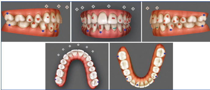
[Table/Fig-3]: First ClinCheck.

The results after orthodontist adjustments were predicted by ClinCheck and shown to the patient [Table/Fig-3]. The patient approved the treatment with mandibular right lateral incisor extraction. The treatment included 14 trays for the upper arch and 28 for the lower arch. The patient was instructed to change the trays every 14 days when she visited the office. Passive trays were used for the upper arch until the lower arch treatment was finished.