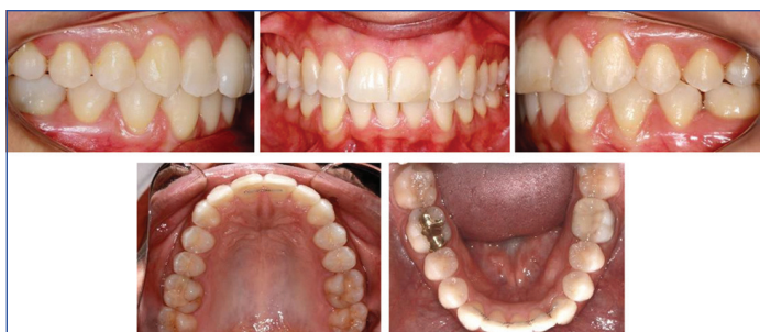
[Table/Fig-9]: Post-treatment intraoral photographs.