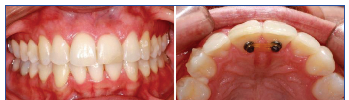
[Table/Fig-8]: Bonded bottoms used to close maxillary central incisor diastema.

A small diastema between the upper central incisors was observed during this phase. Two bottoms were bonded on the palatal surface of these teeth, and an elastic chain was used to close the space [Table/Fig-8].