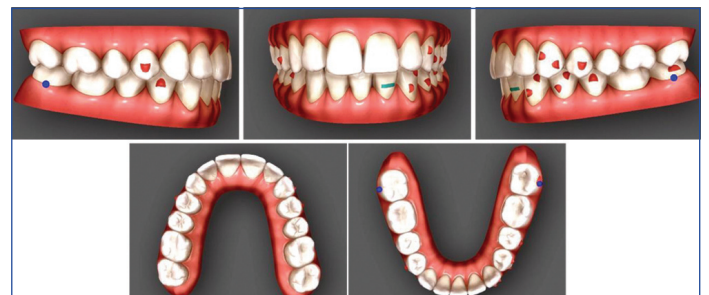
[Table/Fig-7]: Second refinement ClinCheck.

A second refinement was required after professional adjustments [Table/Fig-7], which was shown to the patient and approved. This refinement included 10 trays for upper and lower arches, which were changed every 14 days.