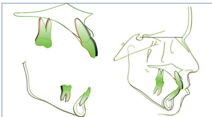
[Table/Fig-11]: Cephalometric superimposition tracing.