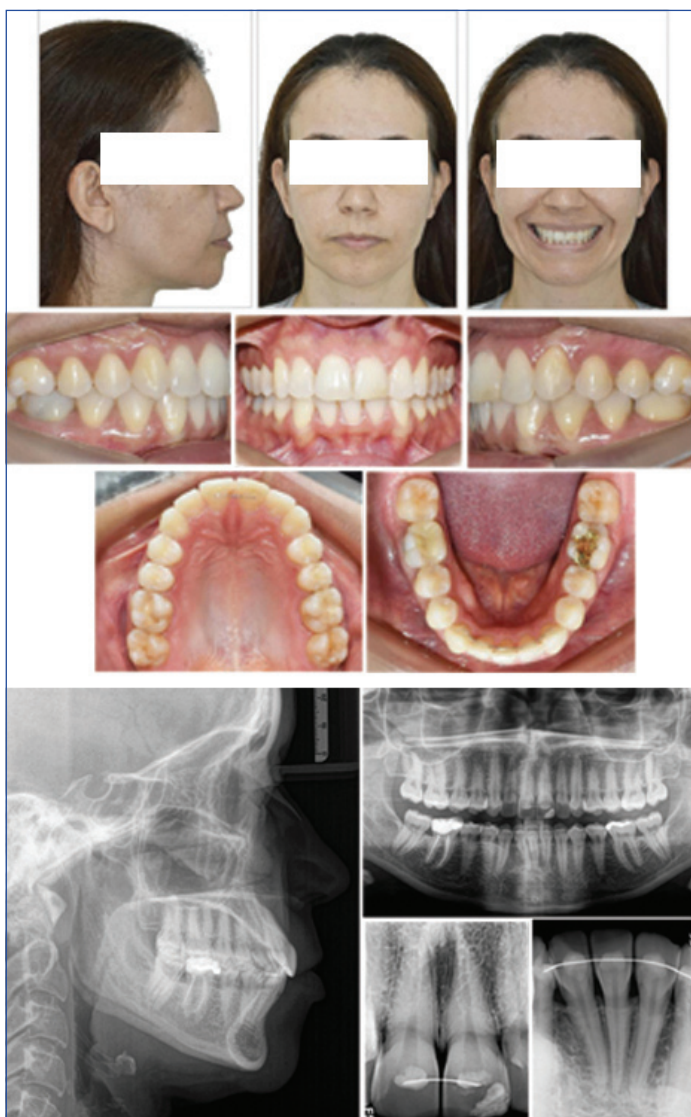
[Table/Fig-10]: At 2 year follow-up.