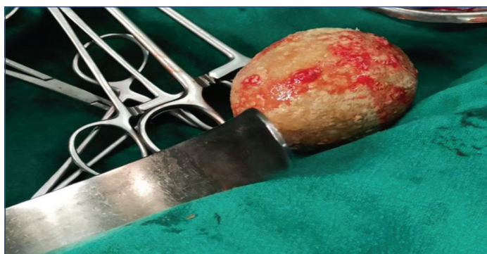
[Table/Fig-2]: Case 2 Large urinary bladder calculus removed by cystolithotomy performed just after planned caesarean section for full term obstructed labour due to antenatal diagnosed case of large urinary bladder calculus.

Patient was taken for LSCS with cystolithotomy after taking well informed written consent. Patient delivered a male live baby of 2.4 kg weight on same day of admission. Baby cried immediately after birth attended by Paediatrician and Appearance, Pulse, Grimace, Activity, and Respiration (APGAR) after five minutes was 10. Cystolithotomy was performed by surgery on call consultant and removed a large stone of about 6x5.6 cm [Table/Fig-2]. Haematuria was disappeared on 2 nd day and catheter kept for 21 days. Her caesarean stitches wound got infected and resuturing was done. Stitches removed on 8 th day of resuturing. Patient was discharged on 22 nd day after removal of catheter. Postoperative period was uneventful.