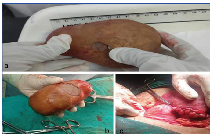
[Table/Fig-3]: Case 3 Large urinary bladder calculus was removed by cystolithotomy performed just after emergency, caesarean section for full term obstructed labour with intrauterine growth retardation.

Steroid was given. Urinary bladder stone cannot be visualised in next day USG (may be due to foetal head shadowing, pelvic bone shadowing and calculus deeply impacted in pelvis). Next day, on P/V examination same findings were noted. Good uterine contraction was also noted and hard fixed mass felt anteriorly. Caesarean section was done. Patient delivered a preterm, 1.7 kg weight, male baby on 3 rd day of admission. Uterus was not corresponding to gestational age because baby had IUGR. After that, cystolithotomy was performed by on call surgeon. Large urinary bladder calculus of about 10 to 12 cm of maximum dimension [Table/Fig-3] and 500 gm weight was removed by cystolithotomy. Postoperative period was uneventful. Mother and baby were healthy at time of discharge on 8 th day. Features of all three cases are shown in [Table/Fig-4].