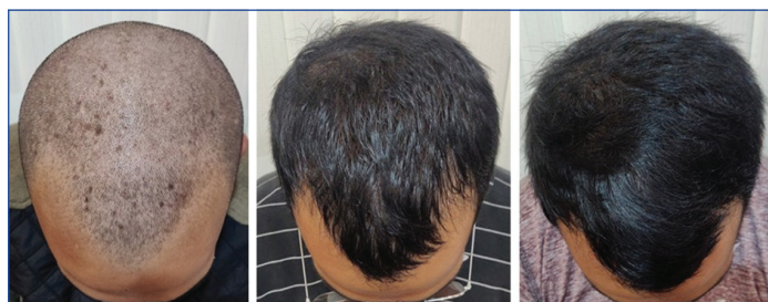
[Table/Fig-3]: Standardised pictures of a subject in group A at different time intervals.

The mean age of the population was 31.2 \pm 5.39 years of age. Group A had mean \pm SD of 32.3 \pm 6.1 years, group B had mean \pm SD of 30.7 \pm 5.2 years. Patients had hair loss for a mean average of 5.3 years (4-8 years). In the present study, it was observed that there was no statistically significant difference in hair regrowth at three months between groups A and B [Table/Fig-2]. However, at six months there was a statistically significant increase in hair growth ( p < 0.05 ) in individuals in group A [Table/Fig-2] as compared to group B; this change was progressive at both nine and 12 months. At both 9 and 12 months, there was a highly significant ( p < 0.001 ) difference between group A and group B [Table/Fig-2]. In the present study, it was observed that upon intradermal administration of PRP and oral supplementation with biotin (group A) there was statistically significant increase in hair regrowth as compared to hair growth after only oral biotin administration. The null hypothesis established at the beginning of the present study, was thus, rejected. Subjects of group A and B at different time intervals, can be seen in [Table/Fig-3,4].