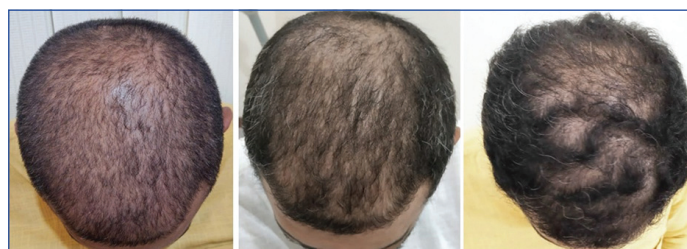
[Table/Fig-4]: Standardised pictures of a subject in group B at different time intervals.

factor has specific functions, which are as follows, regulation of cell proliferation, differentiation and survival by EGF; key regulator of cell metabolism and growth by IGF; PDGF promotes the synthesis of collagen and proteins and is a major mitogen for connective tissue cells, TGF regulates cell proliferation, differentiation, apoptosis, induction of intimal thickness, and, VEGF regulates angiogenesis [12]. These growth factors are vital for the growth and development of the hair follicle in all its stages, from anagen to catagen to telogen. The growth factors contained within the alpha granules of platelets act on stem cells in the bulge area of the hair follicles and stimulate the development of new follicles along with neovascularisation [18]. An understanding of the role of the aforementioned growth factors is critical to the successful management of AA. It is the miniaturisation of this hair follicle due to Dihydrotestosterone (DHT) [19], that results in AA.