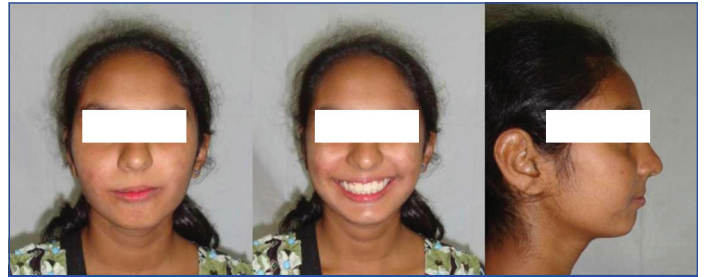
[Table/Fig-5]: Post-treatment extraoral photograph showing balanced facial profile.

The crowding of both dental arches and the deviation of the maxillary dental midline were corrected, and the results are shown in the post-treatment stage [Table/Fig-5,6]. The post-treatment panoramic radiograph showed parallel roots with no signs of root resorption [Table/Fig-7]. Cephalometric superimpositions on the anterior cranial base (SN plane) confirmed the labial movement of the incisors and a slight inferior movement of the mandible. Molar eruption was within a normal range [Table/Fig-8].