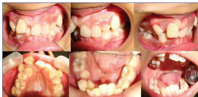
[Table/Fig-2]: Pretreatment intraoral photographs, showing anterior deep bite, missing upper right and lower left lateral incisor and transposition between upper canine and first premolar bilaterally and microglossia.

Second phase included correction of the malocclusion using a fixed orthodontic appliance without extraction.