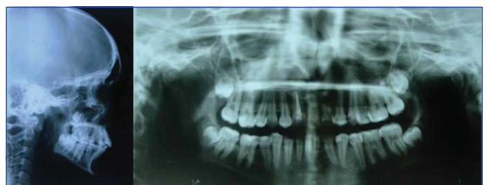
[Table/Fig-7]: Post-treatment radiographs showing ideal angulation and inclination of the teeth.