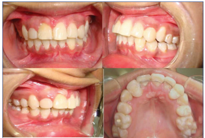
[Table/Fig-6]: Post-treatment intraoral photograph showing well-aligned arches with ideal overjet and overbite.