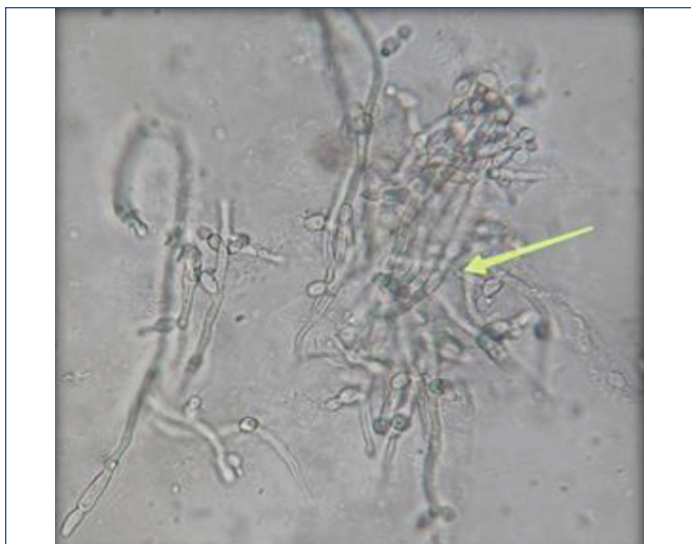
[Table/Fig-2]: KOH mount of sputum sample with 10% KOH showing pseudohyphae with budding yeast cells.